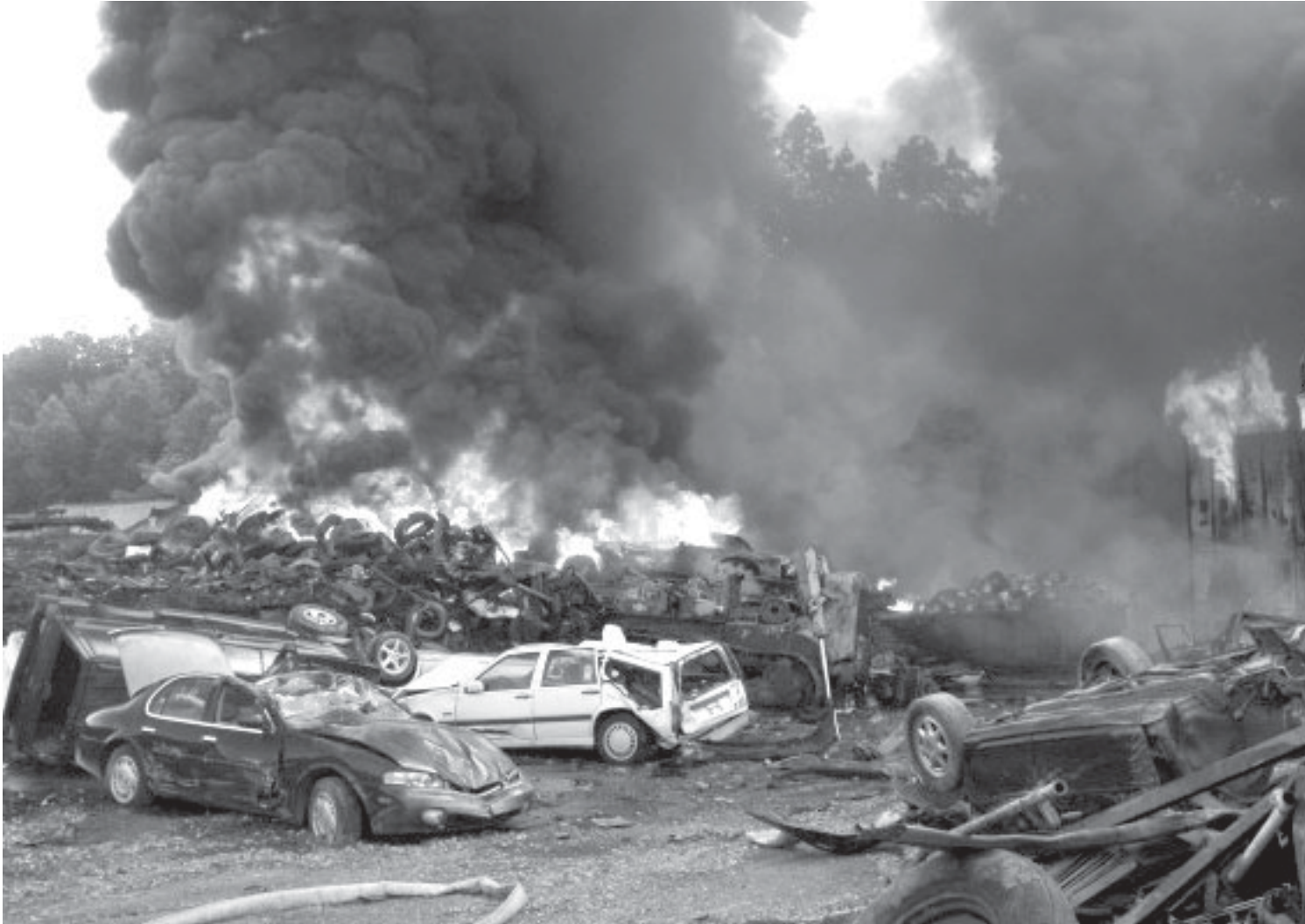
More than 200 firefighters from across the state responded to M&J Auto Recycling Inc. in Colchester last Friday, June 13. Smoke from the blaze could be seen as far west as New Haven.