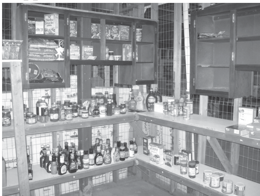
The local food bank is in desperate need for donations as the food is disappearing off the shelves because more and more people are looking for help.

Taylor does not put restrictions on those that need food. In her opinion, “if someone calls to