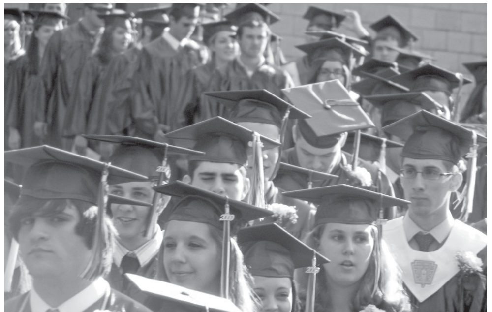
Above, some of the 225 members of the Bacon Academy Class of 2009 file into the graduation ceremonies. At right, the students line up at the stage to receive their diplomas.