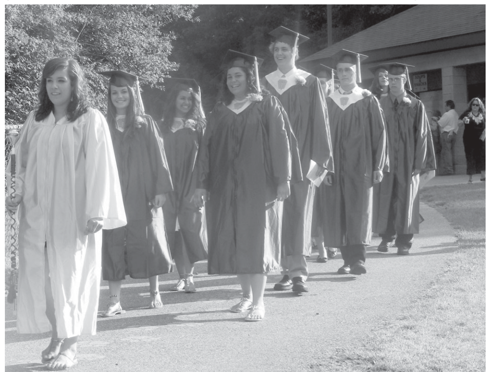
Members of the Bacon Academy Class of 2009 proceed into their graduation ceremonies last Friday night in Colchester.

"Only then can you begin to appreciate that