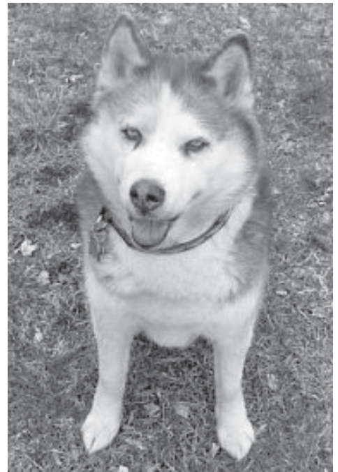
Ally, a Siberian Husky, has been named Colchester's "Top Dog," after winning an online contest.

Beginning July 1, dog owners will be fined $1 per month late fee for not registering their