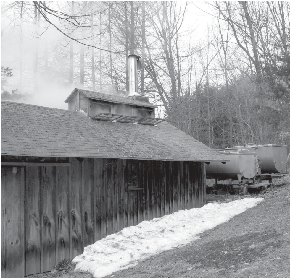
The sap was boiling and steam was wafting at Wenzel's Sugar House on Thursday, in preparation for the 21st annual Hebron Maple Festival this weekend.