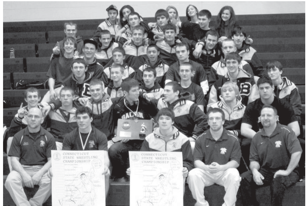
The Bacon Academy wrestling team won the State Open Championship, ending a 10-year run for Danbury High School. Pictured above are the Bobcats after capturing the Class M title at Windham High School.