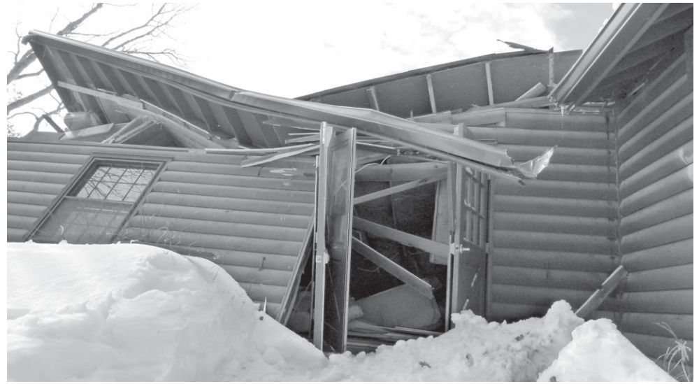
Selectmen denied a request from the 4-H Camp to waive its building fees to reconstruct Baldwin Hall. Pictured above is the building after it collapsed early February due to snow that had accumulated on the roof.

He said plans are similar to what were shown at a public hearing last month, except the en-