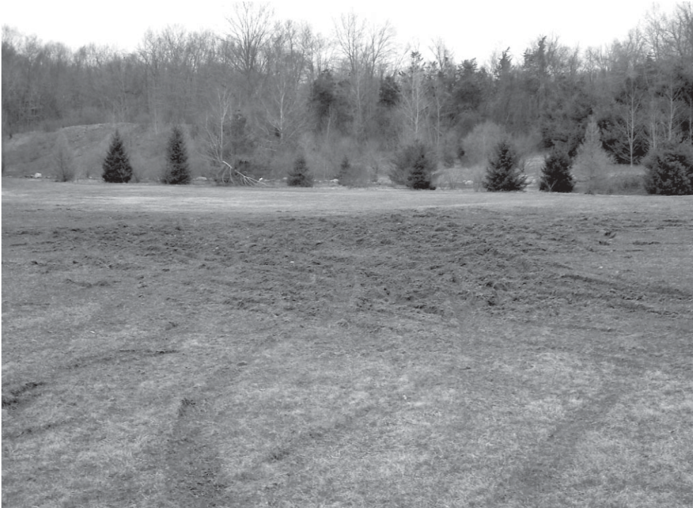
Four youths who were allegedly four-wheeling on the multi-use fields at Camp Ingersoll have been identified by Portland Police and have agreed to help repair the damage that is shown above.

After next Monday’s meeting, the next step is a district meeting Monday, May 2, and then a referendum Tuesday, May 3.