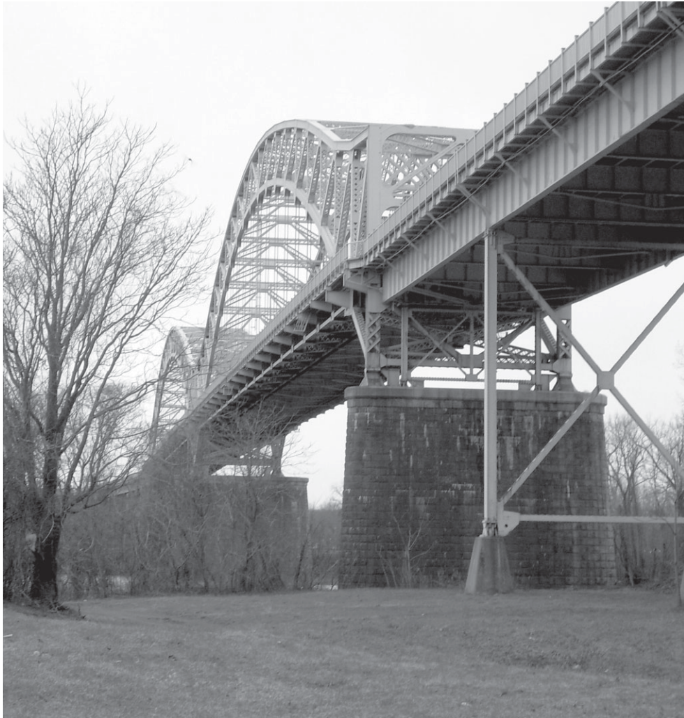
The Middlesex Chamber of Commerce recently discussed plans to revamp the Arrigoni Bridge. Repairs will begin this summer and the final stage is slated to finish in October of next year.