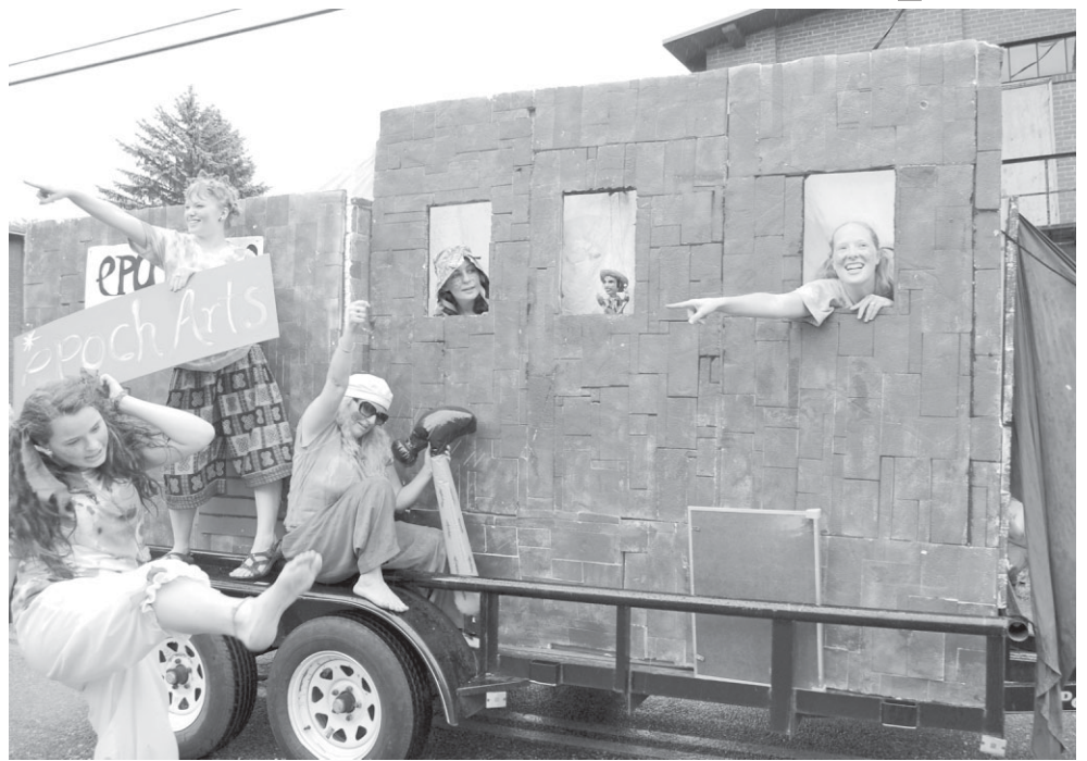
The three-day Old Home Days event has returned to East Hampton. The annual festivities began yesterday and will run through Saturday. One of the highlights is the annual parade, which will take place on Saturday. Pictured is a float from last year’s parade, designed by the non-profit organization Epoch Arts.