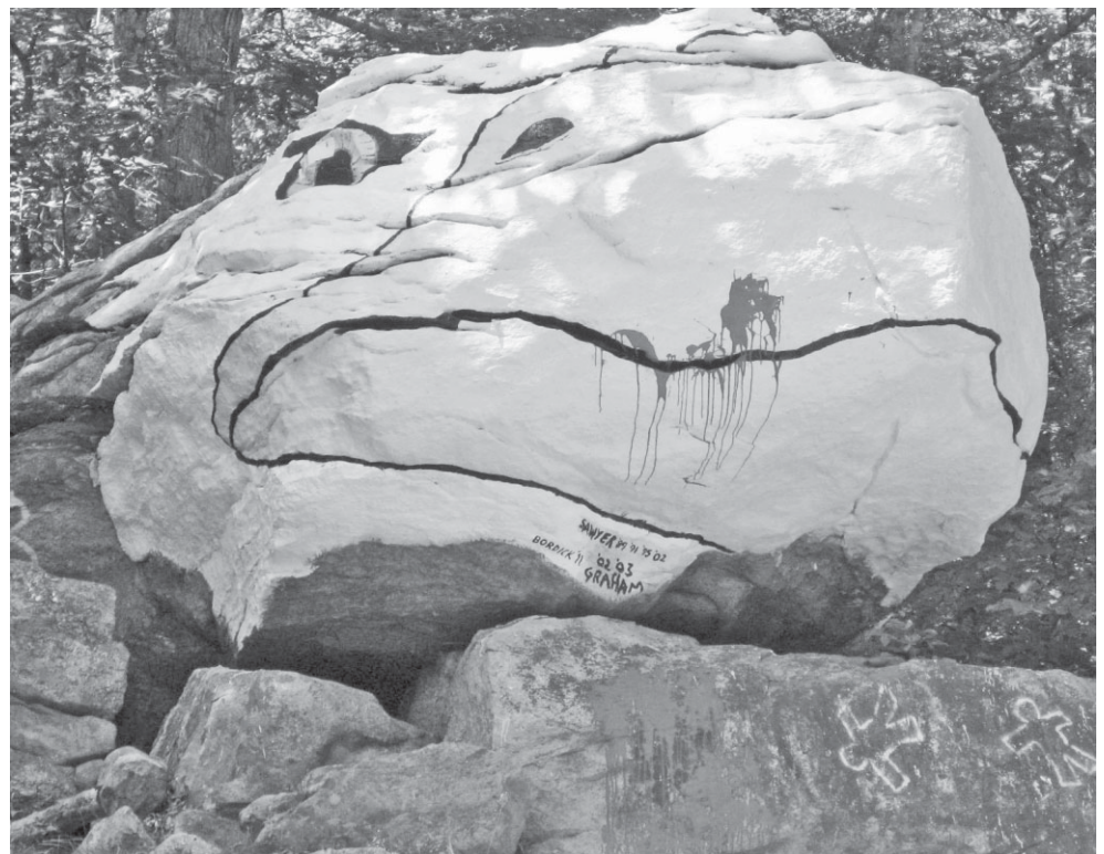
Eagle Rock, located in Hebron on Route 66, was vandalized with red paint over the Fourth of July weekend. The local landmark had recently been spruced up by area residents.