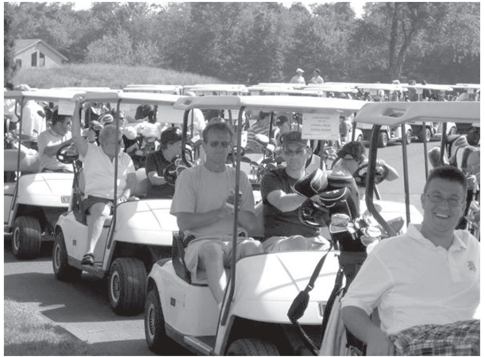
The annual AHM Invitational Golf Open returns next Monday to the Blackledge Country Club. Pictured is a scene of happy golfers ready to “start their clubs” at last year’s event.