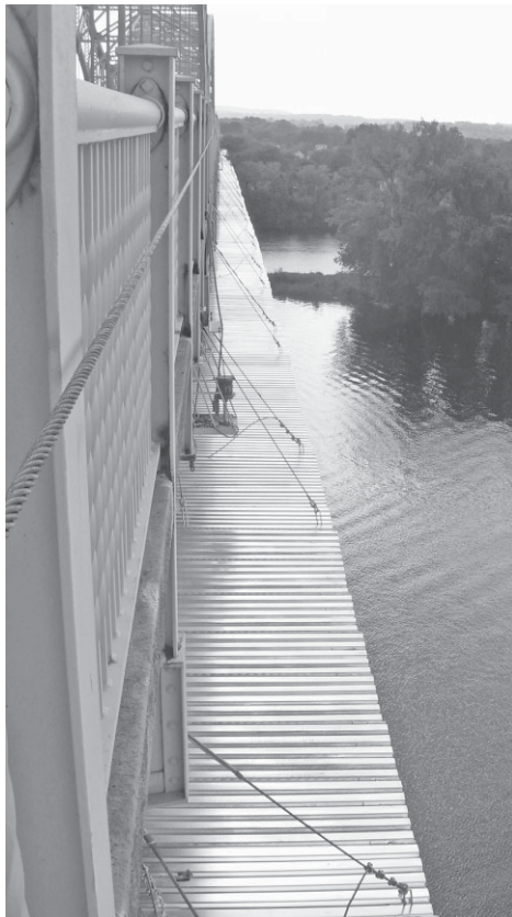
Shown here is the platform which the DOT and The Middlesex Corp. are utilizing as they complete work on the Arrigoni Bridge.