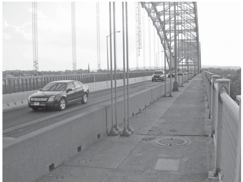
Portland residents braced themselves for the worst when construction on the Arrigoni Bridge began in late June. But, one month into the project, things seem to be going smoothly. According to the DOT’s director of communications, “it certainly hasn’t been the traffic monstrosity we thought it might be.”