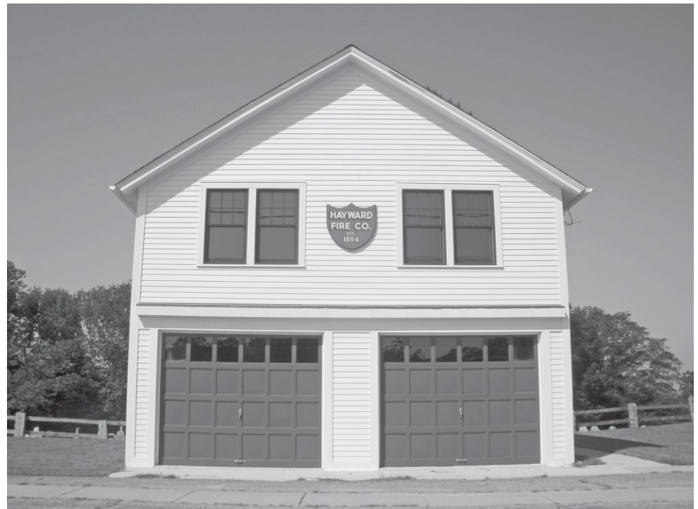
The Colchester Hayward Volunteer Fire Department is making plans to transform its old firehouse into a new museum. Shown here is the firehouse as it currently looks.

Looking around the room it was easy to see, with a little work, how the building could be