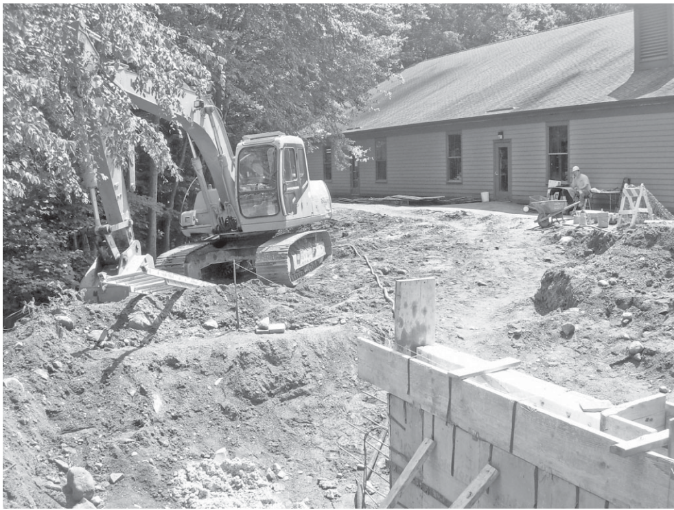
Contractors broke ground this summer, seen left, on a 1,500-square-foot addition to the East Hampton Senior Center on Main Street, a project that was funded by a $750,000 state grant the town received two years ago. The result: a beautiful new “multi-purpose” room, seen right, that will serve as the center’s cafeteria and will provide more room for various activities and programs. With the final touches being completed this week, the senior center is scheduled to officially reopen on Tuesday, Jan. 17.