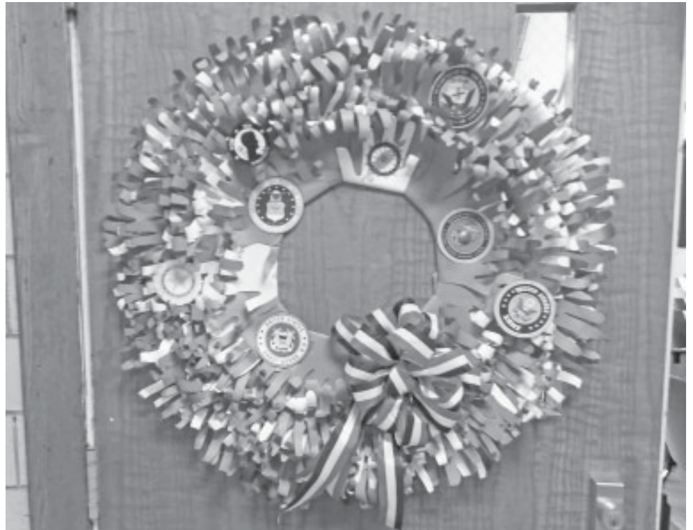
In preparation for the program, Brownstone students made a wreath of their own, made from the outlines of each student's hand, that was hung on the front door of the school auditorium.