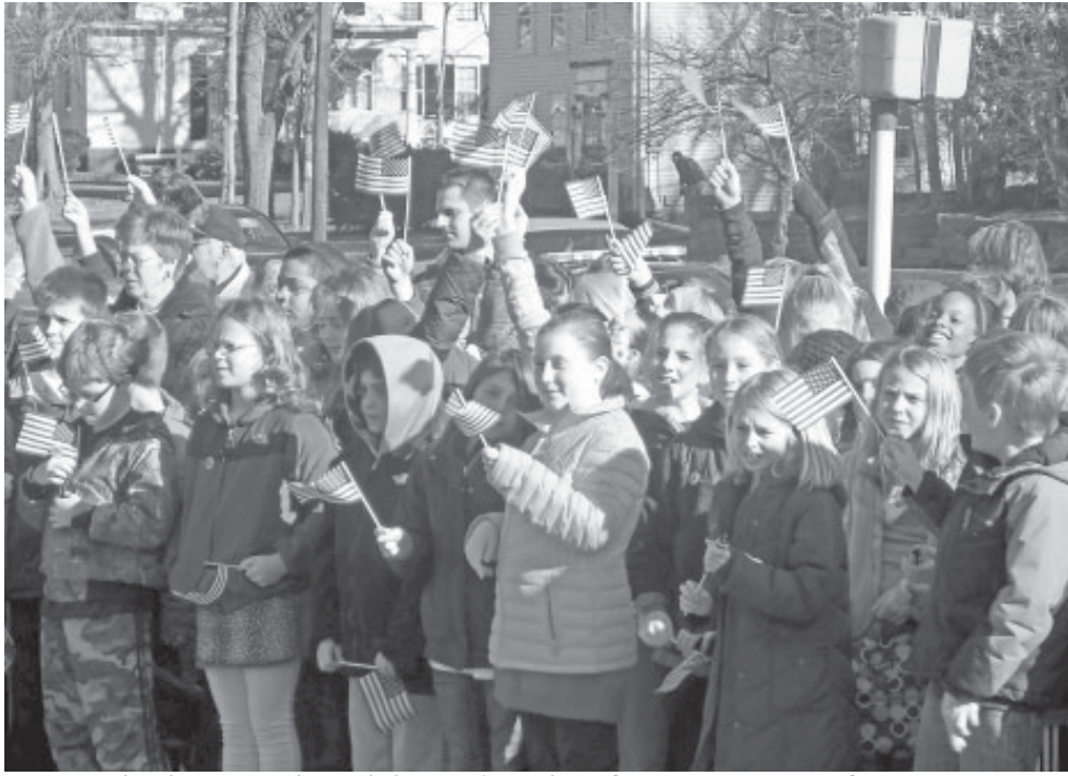
Enthusiastically waving miniature American flags, the students from Brownstone Intermediate School proudly welcomed the Wreaths Across America program on Tuesday morning. The wreaths made several stops across Connecticut on their trip from Maine to Arlington National Cemetery, where they will be laid on the graves of veterans this weekend.