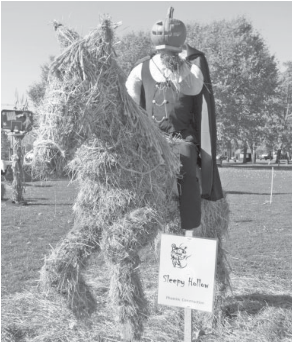
Some scarecrows stationed in the Colchester Town Green this week as part of the town's annual scarecrow contest this week are colossal creations. The "Sleepy Hollow" scene featuring a life size horse and headless horseman turned heads this week. It was created by employees of Phoenix Construction of Colchester.