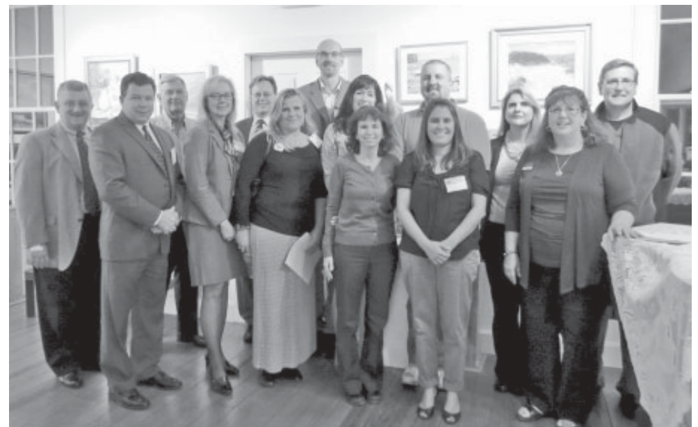
Fourteen candidates for next month's elections attended a "Meet the Candidates" forum hosted by the Marlborough Business Association last Thursday, Oct. 17.