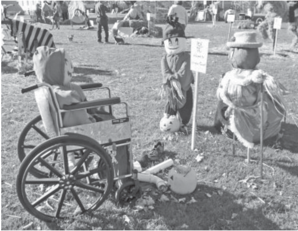
Colchester's Harrington Court was represented on the green. The scene made use of a wheelchair, and showed scarecrows and a pumpkin person in friendly conversation with one another.