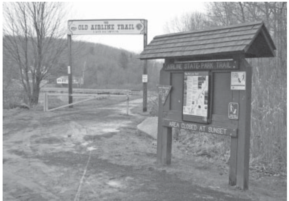
A presentation last Tuesday by the Jonah Center for Earth and Art, of Middletown, discussed the possibility of extending the Air Line Trail from East Hampton into Portland and eventually into Middletown. The public presentation set the stage to make the extension possible. Pictured here is an entrance to the Air Line Trail in East Hampton.

This time around, the funding request would be different. If and when the town applies for