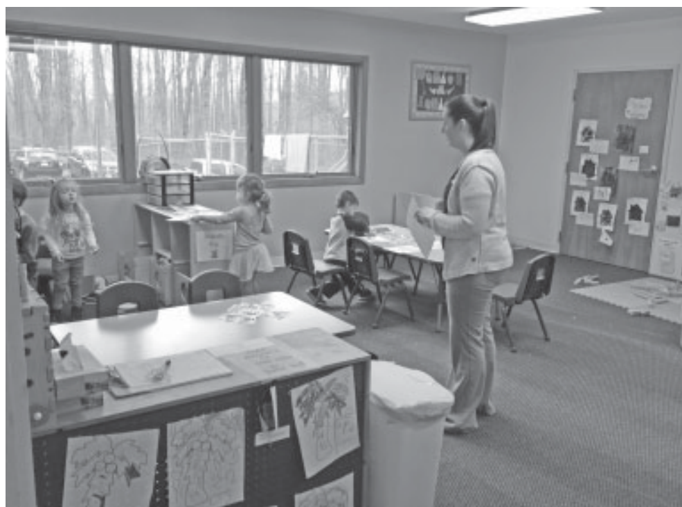
Discovery Zone, a child care center that was founded in Columbia, opened its third location in Hebron at the end of August. The center looks to provide care, routine and education in order to foster well-rounded children who are prepared for school.

The center accepts children age six weeks up to 12 years and the goal from the beginning “is to prepare kids socially, emotionally, edu-