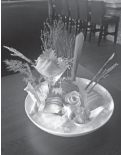
Pictured above is one of the many sashimi dishes found on the new restaurant’s menu, which shows just how creative the sushi chefs get when creating dishes.

Residents interested in trying the new hibachi grill can dine in or get take-out at Toyo Hibachi and Asian Fusion on weekdays from 11 a.m.-10 p.m. or on weekends from 11 a.m.-11 p.m. Those interested in learning more about the restaurant or to order take-out can also call 860-537-3800.