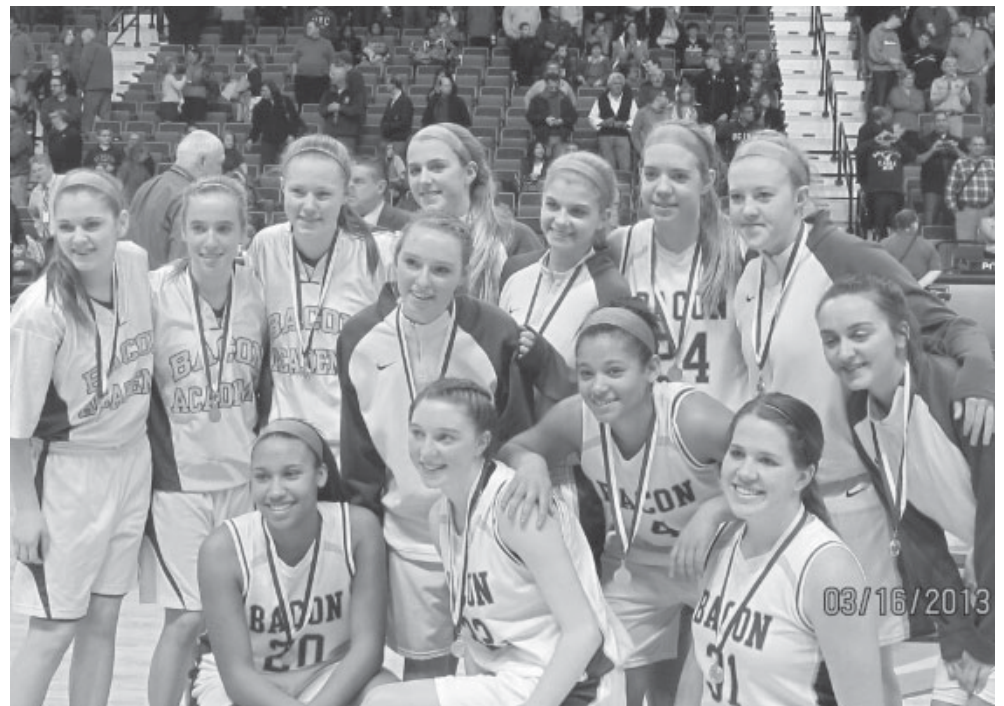
The Bacon Academy girls' basketball team smiles with their silver medals after coming up short in the Class L State Championship final against Farmington High School on March 16 at the Mohegan Sun Arena. The players, five of whom are seniors, led a successful season coming out as the top-seed and ending with an overall record of 24-3.