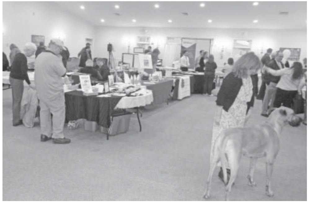
From realtors to restaurants, contractors to a kennel, the services Hebron businesses provide run the gamut. And on Tuesday, the public had an opportunity to learn about them all, as close to 30 businesses filled the Lions Den for an evening of networking, at the Hebron Business Showcase.

“More businesses are coming,” she said. “More people are getting out and networking.”