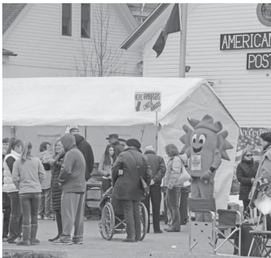
A Mapley Good Time... Despite the cold weather, crowds flocked to Hebron last weekend for the annual Maple Festival. Many congregated in the center of town for burgers, chili dogs, ice cream – and a chance to meet Mr. Maple Leaf himself. A story and additional photo appears on page 22.