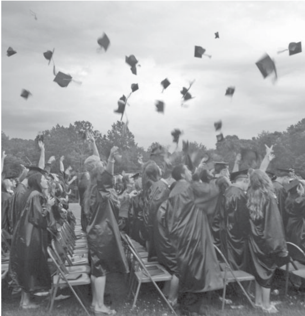
Bacon Academy class of 2013 graduates toss their hats into the air after receiving their anticipated diplomas Monday night. More photos of the Bacon Academy graduation are available online at glcitizen.com .