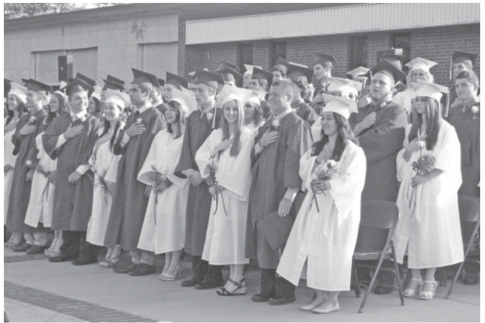
The East Hampton High School Class of 2013 participates in the Pledge of Allegiance at the beginning of the graduation ceremony Friday, June 21. An hour and a half later, they were graduates. More photos available at glcitizen.com .