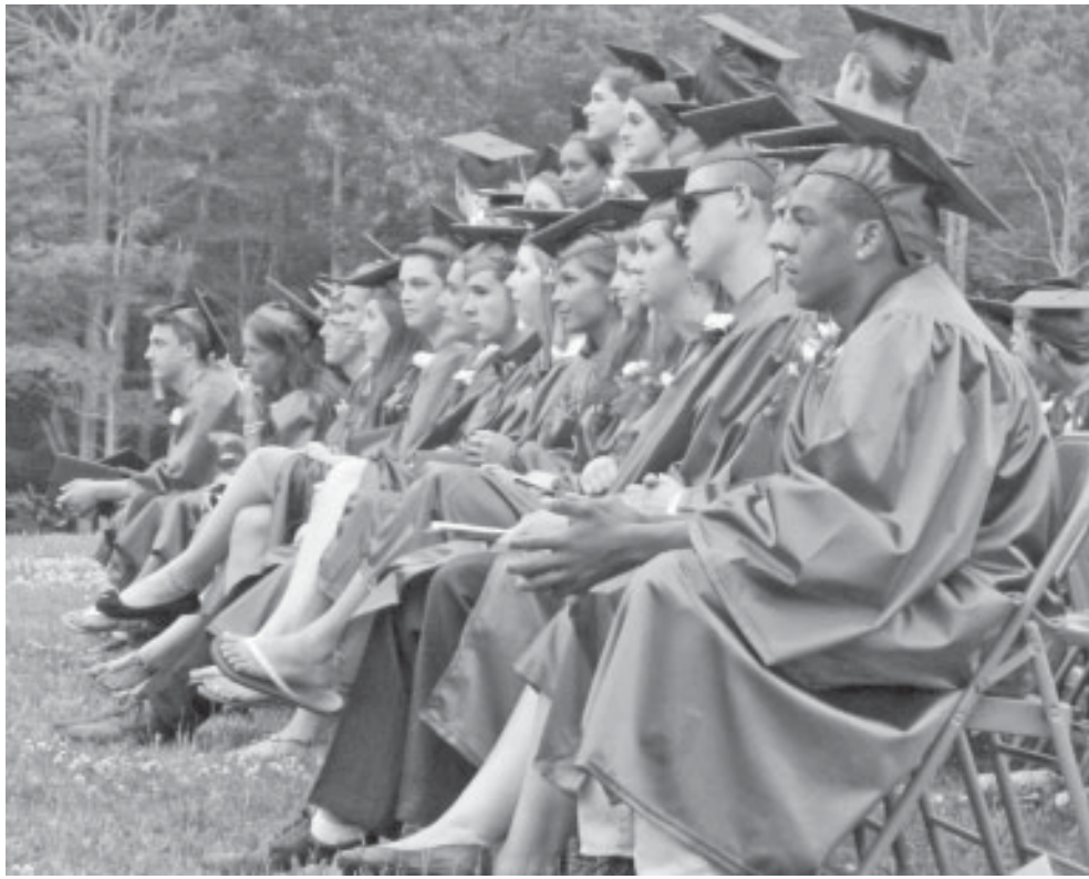
Bacon Academy graduates look toward the stage that was stationed on the high school's football field to watch fellow classmates receive their diplomas.