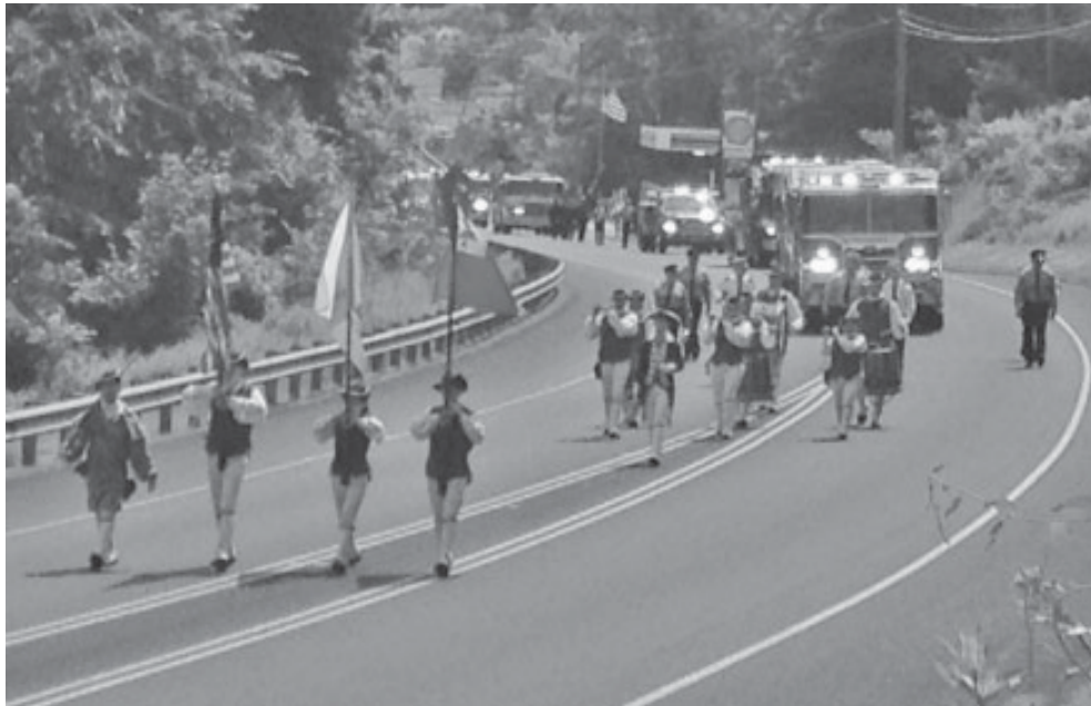
The parade in celebration of the Andover Volunteer Fire Department's 75th Anniversary traveled along a section of Route 6 and touted fire trucks from over a dozen area towns.