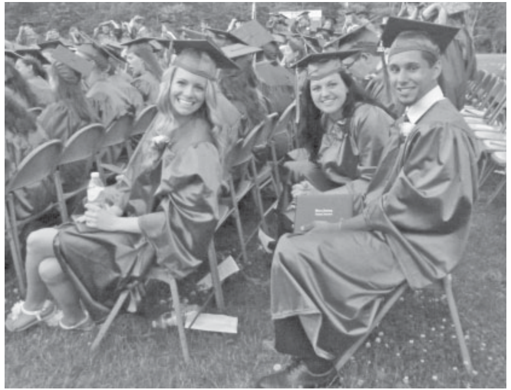
Members of the 2013 Bacon Academy graduating class are all smiles just minutes after receiving their diplomas. The Bacon Academy community bid farewell to 250 graduates on Monday, June 24.

In typical Bacon Academy fashion, the class also listened to a recording – as the graduates do each year at graduation – of the Bacon Academy faculty leaving the students with one last