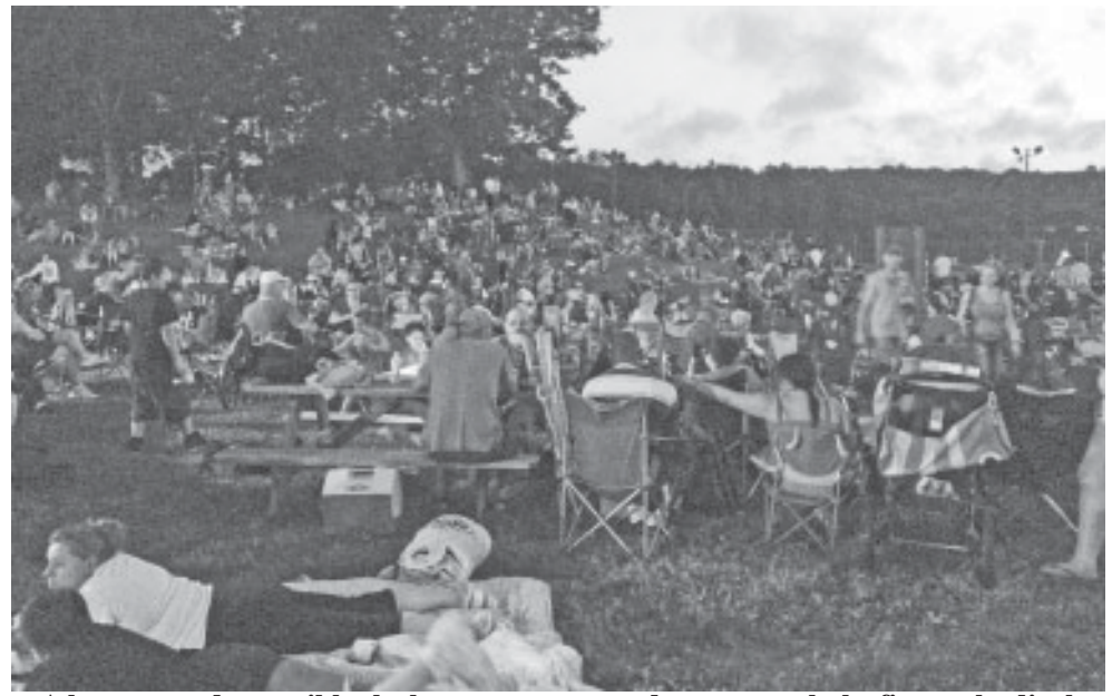
A large crowd – possibly the largest yet – turned out to watch the fireworks display put on by the Hebron Lions Club June 29. Spectators lounged around, socialized, enjoyed live music and treats like fried dough and sundaes before the sun went down and the anticipated show lit up the sky.

Attendees also had the opportunity to listen to the band Uninvited Wilson play throughout the afternoon.