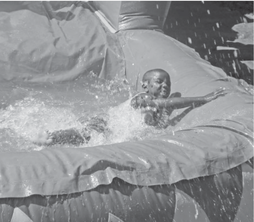
A joyful youngster slips down the inflatable waterslide at last year's Kids Karnival. The slide will again provide some refreshing fun at this Sunday's second annual Kids Karnival. The children of Chatham Court can expect a full day of activities.

These contributions help pay for food, drinks, and rental activities like inflatable water slides, a tent for shade, the clown, a cotton candy machine and ice cream. Anyone else who wishes to donate can send checks, made payable to Portland Housing Authority, to: Portland Housing Authority, 9 Chatham Court, Portland, CT 06480. In the memo, donors should write "Second Annual Chatham Kids Karnival."