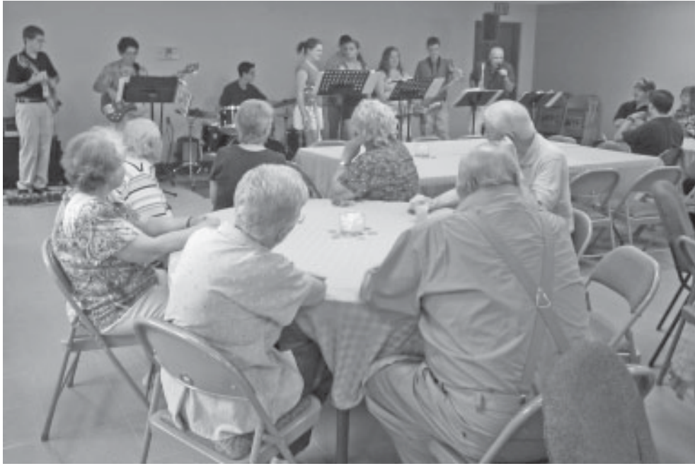
Residents of the Florence S. Lord Senior Housing listen to music played by local band The Modern Riffs last Sunday, July 28, during the senior housing facility's 20th anniversary celebration. The complex opened in 1993 and is still known today as the only senior housing facility in Marlborough.