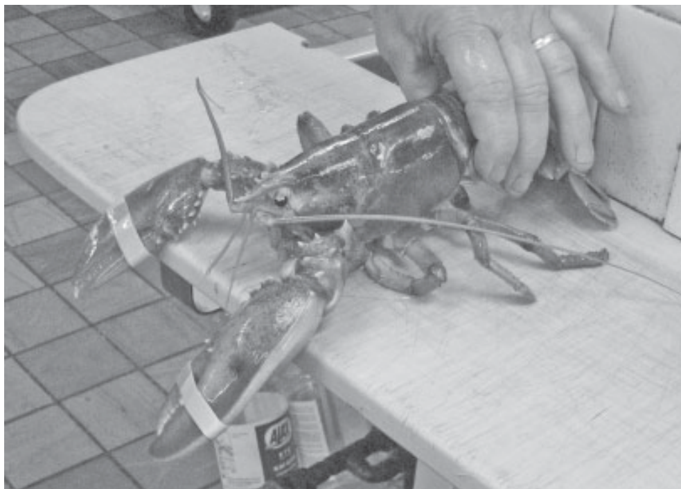
Shown here is Blue Lou, the blue lobster that was discovered in Tri-Town Foods grocery store in Portland. A blue lobster is the result of a genetic mutation or limited diet. Blue Lou has been donated to the Maritime Aquarium in Norwalk.

Regardless, lucky Blue Lou will never have to worry about a boiling pot of water.