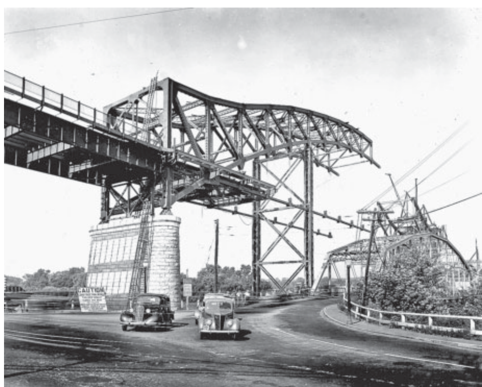
A Glimpse of Portland Past... This photo, taken during construction of the new Middletown-Portland (later rededicated as Charles J. Arrigoni) Bridge in 1936-38, shows several cars coming off the 1896 bridge on the Middletown side of the river. The old bridge remained in service throughout construction. The picture is one of many featured in the "Portland River Crossings" exhibit, which will be open this Sunday at the Ruth Callander House Museum of Portland History. For more information, see a related story on page 22.