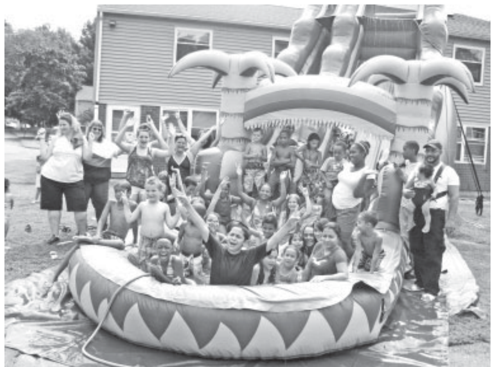
The Karnival proved a big hit for all in attendance, and organizers are already eagerly planning next year's event.