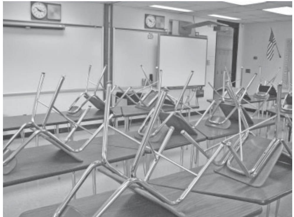
Next week the chairs in this East Hampton High School classroom will be in their upright positions and filled with students. Classes start next Thursday, Aug. 29.

Last year also marked the beginning of the