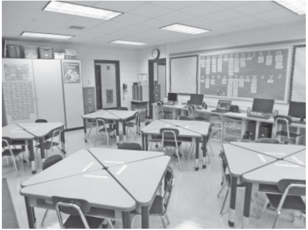
One of MES' exciting new additions is its new furniture that will appear in three of the school's classrooms. The furniture is a part of the school's one-year pilot program coined "Classroom of the Future." In Mary Cochefski's third-grade classroom, triangular desks are arranged in square tables, though the teacher said they can be arranged in multiple ways.