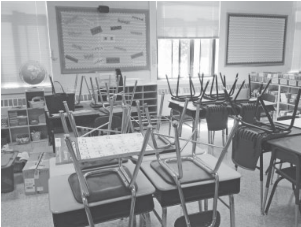
On Tuesday, staff at Andover Elementary School could be found working on final preparations for the new school year. The grounds were orderly, the corridors and lockers were clean and empty, and the classrooms were decorated, organized and stocked with fresh supplies, ready to welcome students next Wednesday, Aug. 28.