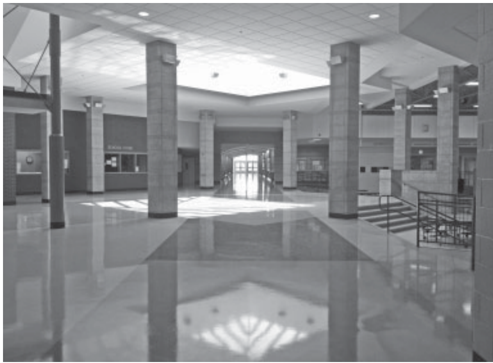
The hallways at RHAM were gleaming – but noticeably empty – this week as staff and administrators made their final preparations for the new school year. All the preparations will come to a head, and the silence will dissipate next week when students return.