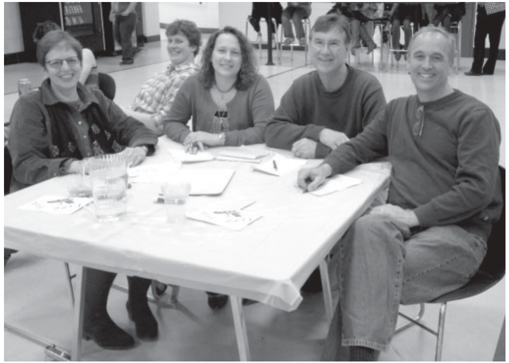
At the RHAM Education Foundation's fifth annual Adult Spelling Bee, the Wannabees from Marlborough, left, came out on top after successful spelling "diphthong." Although they didn't win, team Beeware, right, which consisted of faculty from RHAM High School, was happy to have made it almost 20 rounds, a significant improvement from the year prior when they clocked out after the first word.