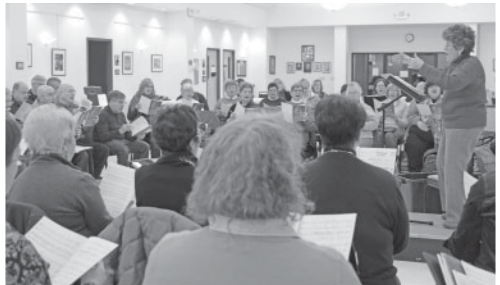
The 87-member Middlesex Hospital Vocal Chords rehearse for their 25th anniversary spring concert in May at Portland High School. The group has performed for a variety of audiences including hospital patients, the public at large and the pope.

"It's the things we do outside of the concerts that mean the most to me," she said. "One time