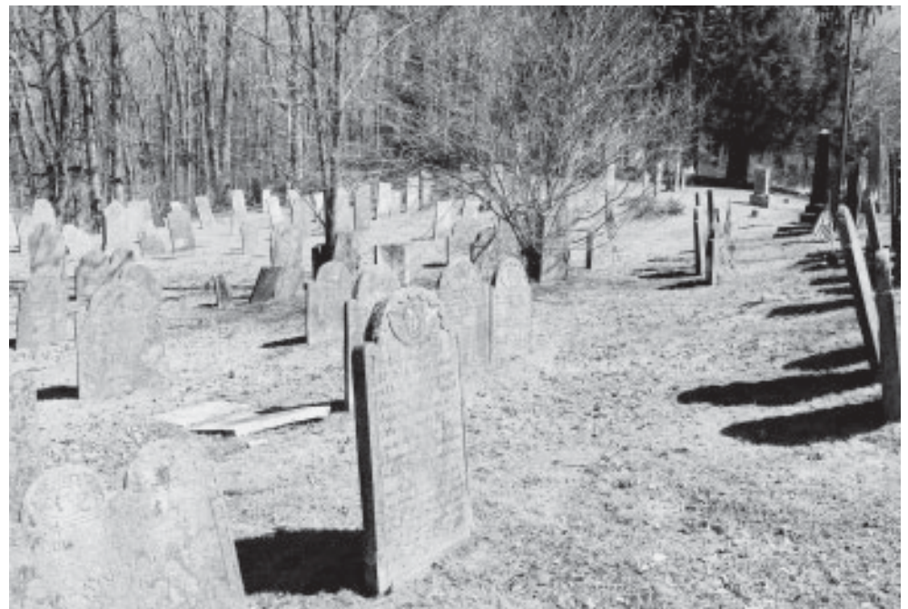
There are a number of empty areas in the Old Andover Cemetery and only about 100 gravestones. But appearances can be deceiving, and resident Mike Donnelly has been able to determine over 300 people are buried on the property – people with plenty of interesting stories to share, as his research has unearthed.