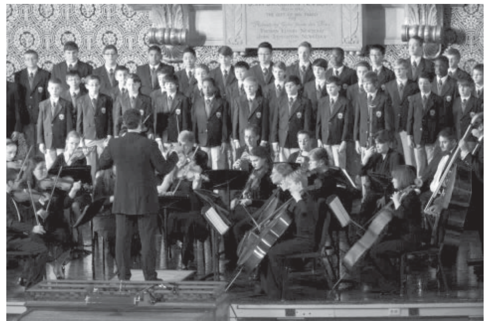
Members of the Colchester Civic Orchestra headed down to Yale University last year to film a scene for the Dustin Hoffman movie Boychoir .