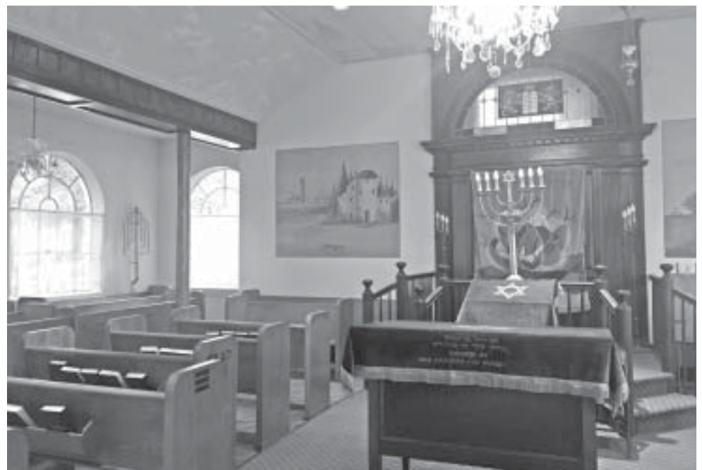
The inside of United Brethren of Hebron Synagogue looks much as it did when it was built; scenes of Israel are still painted on the walls, and a separate seating area for women can still be found off to the left. This year marks the 75th anniversary of the construction and opening of the building, and a kick-off of the yearlong celebration will take place next Wednesday, Sept. 30, at 10 a.m.