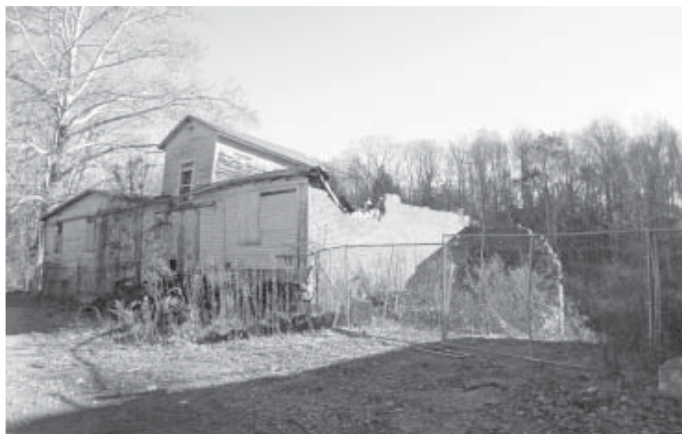
One of the side buildings behind the main Norton Paper Mill structure is one of the areas where contamination was found on the property. Director of Public Works Jim Paggioli said some of the PCB-contamination is contained within and under the building.

If the town goes forward with the demolition of the structures and removal of the tank, the property would be left stable with the foun-