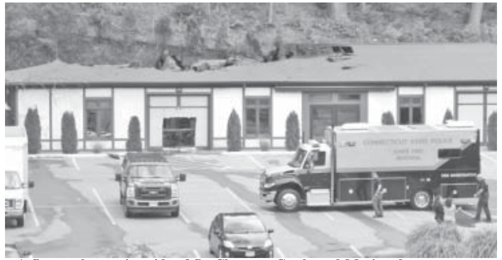
A fire on the marina side of St. Clements Castle and Marina drew a response from at least nine towns on the afternoon of June 25. When firefighters cleared out after several hours, fire marshals from East Hampton and the Office of the State Fire Marshal began their investigation, which was still ongoing at press time.