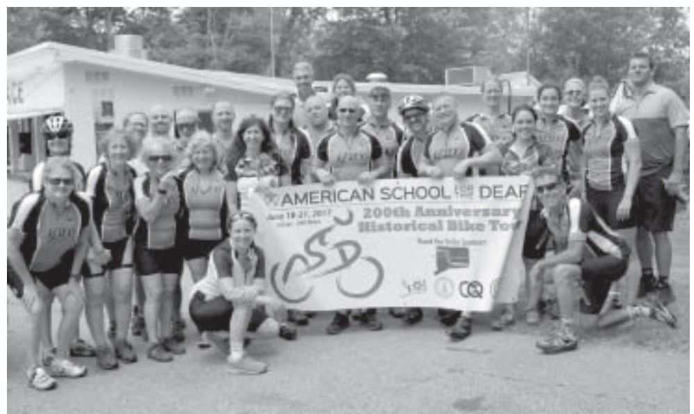
On June 18 through June 21, 42 bikers – which included alumni, staff and supporters of the American School for the Deaf – partook in a 200 mile bike tour, visiting historical sites across the state related to deaf education to celebrate the school's 200th anniversary. One of those stops was Harry's Place.

According to Bravin, other riders on the tour included “some alumni, some staff, and some people who just wanted to join and celebrate with us.”