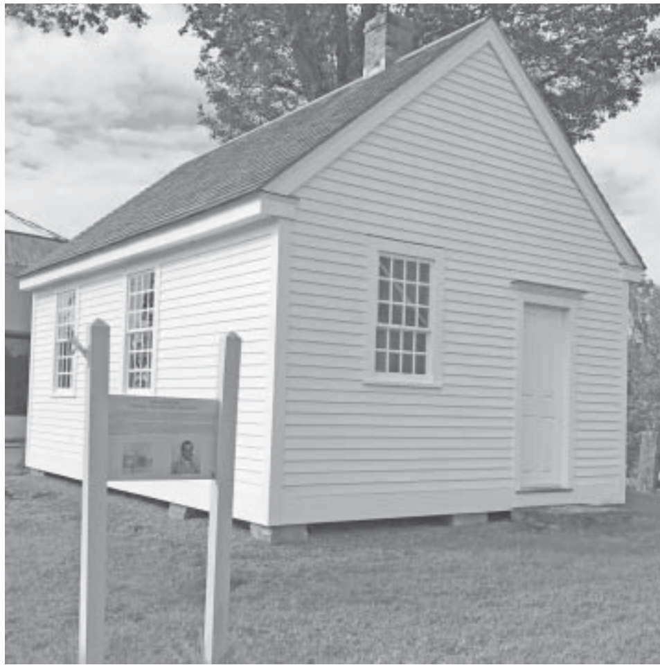
On Friday, Sept. 15, the new replica of the historic School for Colored Children on South Main Street – believed by some local historians to have predated state heroine Prudence Crandall's pioneering school – will be dedicated as a gift to the town of Colchester at 4:30 p.m. See story on page 25.