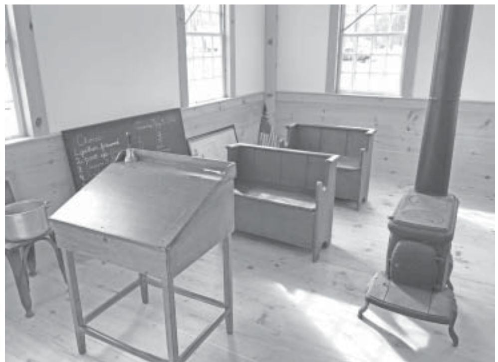
The historic School for Colored Children, which was open during the first half of the 19 th century, had an enrollment of 30-40 children at its height. A new replica of the schoolhouse on South Main Street is being dedicated Friday, Sept. 15.

Slavery remained present in the state until it was finally abolished in 1848 – the same year Bacon started admitting black students.