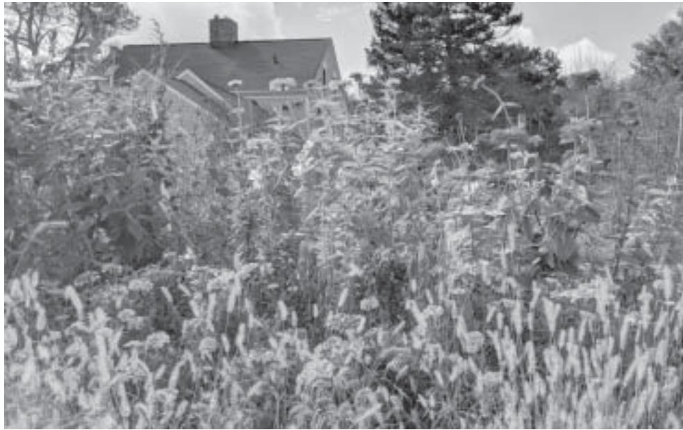
Community gardens, like this one behind the Peters House in Burnt Hill Park, are among the many things the town does that make it a sustainable community, according to Sustainable Connecticut, which has certified it with its bronze award.