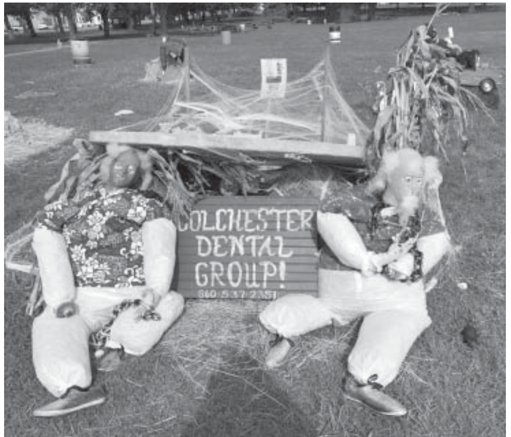
Individuals, businesses and groups constructed straw submissions on the town green for Colchester’s 19th annual Scarecrow Decorating Contest. A scene by Colchester Eye Care (top left) had signs reading “Our patients are the apples of our eyes” and “Eye exams are not scary at Colchester Eye Care,” while the group Colchester is Kind (top right) crafted a scene around the quote “What you do makes a difference and you have to decide what kind of difference you want to make.” Berkshire Hathaway (bottom left) created their own take on The Wizard of Oz and (bottom right) “dental zombies” sporting green and blue heads were the idea of the Colchester Dental Group.