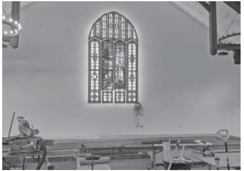
A 14-by-10 foot backlit stained glass window depicting the Good Shepherd is the focal point of the nearly-completed new Worship Center building. Plans are for the first service to be held before Thanksgiving.

"They said when they tested the water all they needed was the drinking fountain up," Santostefano said. "Then they changed their minds and said all the sinks needed to be up so