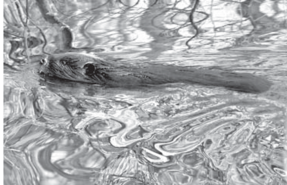
A bridge on a new trail that will ultimately connect to the Air Line Trail in Hebron, the 1.9-mile loop was finished this month and is not yet open to the public but can be accessed from Kinney Road and Church Street. On the right, a beaver swims in Raymond Brook Marsh. The marsh is one of the most scenic areas on the trail with myriad wildlife. Aside from beavers, there is water fowl, deer, an eagle and more for the observant viewer to find.