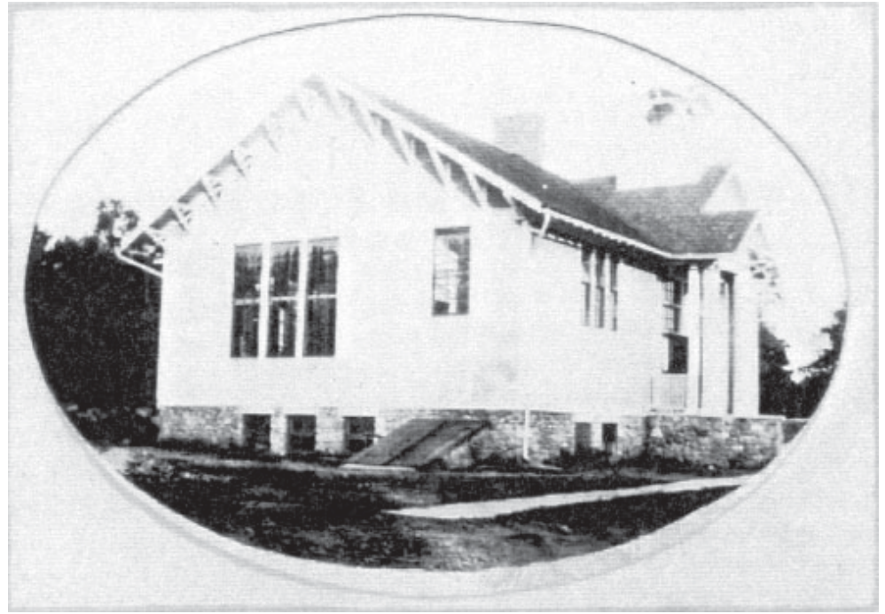
This is the two-room school on Hebron Avenue that the author attended from 1918 - 1926.

With my father, for academic work, A was expected, B was tolerated and C was unaccept-