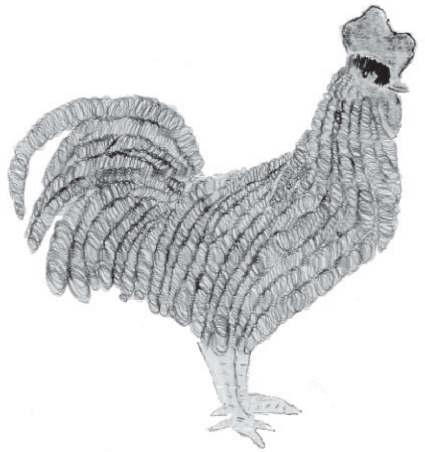
In 1925, elaborate exercises such as this were used to teach good penmanship in Glastonbury schools. This drawing was done by the author as an eighth grader in the old two-room Buckingham School.