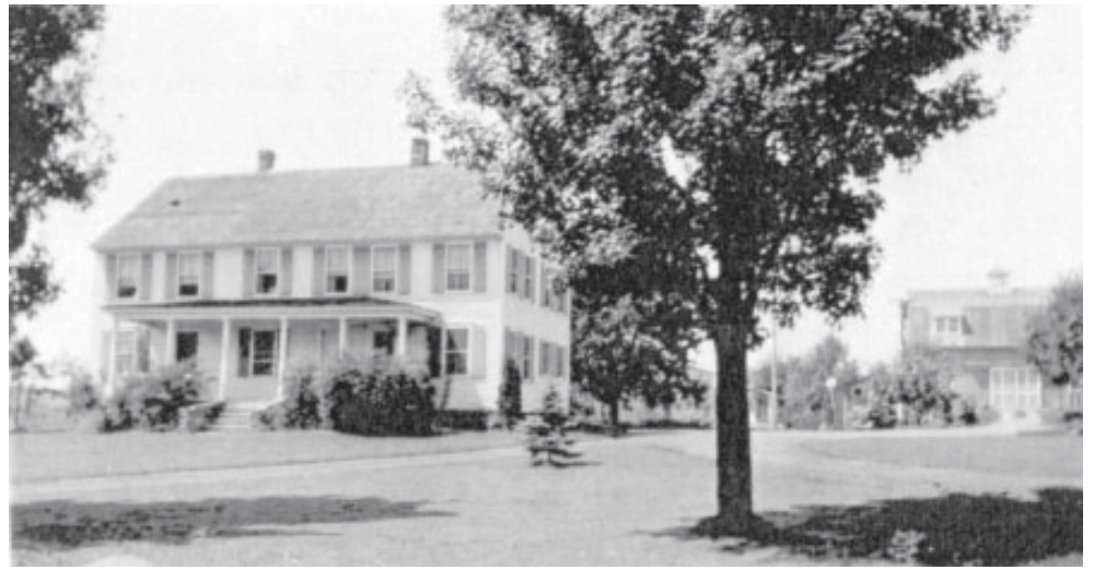
The Saglio family home on Marlborough Road as it appeared in 1938 after it had been expanded and the farm had come to be called Arbor Acres.

Our teachers understood the situation and cooperated. That is why the school year runs from September to June. In an agricultural society the children were needed at home for the harvesting season, usually the summer months.